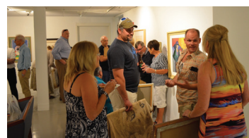
Patrons lined up for valuations

Saturday's event allowed the public to bring in items for valuation from 9 a.m. - 1 p.m. by appointment.