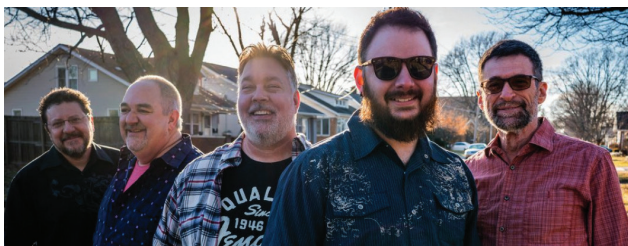
Local Band Capt. Quirk will perform on CEFCU stage.

Friday night will allow art lovers to get the first look at all of this year's fine artists while enjoying a variety of food, beer and wine from local vendors. As the major fundraiser for the Peoria Art Guild, the Friday night event requires a separate nominal fee of $10, which will go towards programming and exhibits for the Guild. Peoria Art Guild Members' free tickets are good only on Saturday or Sunday.